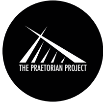
The Praetorian Project praetorianproject.org