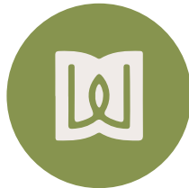
Word Partners wordpartners.org