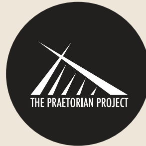
The Praetorian Project praetorianproject.org