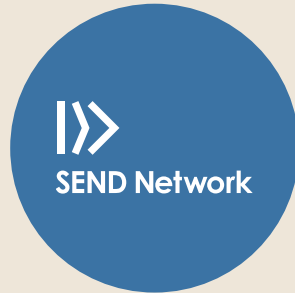
SEND Network namb.net