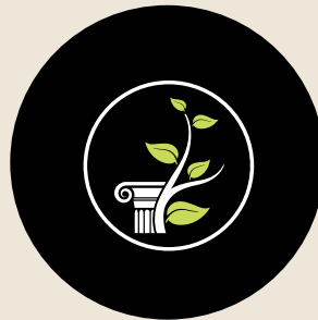
Pillar Church of Dumfries pillardumfries.com