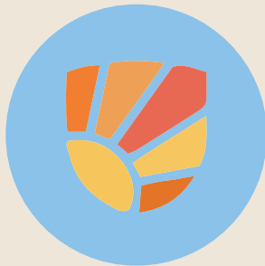
Florida Baptist Convention flbaptist.org